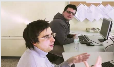
Staff at the cooperative talking about their work.

In Italy, a group of adults with autism who couldn't find satisfying and accommodating jobs in the open labour market have created a cooperative in which they work together.