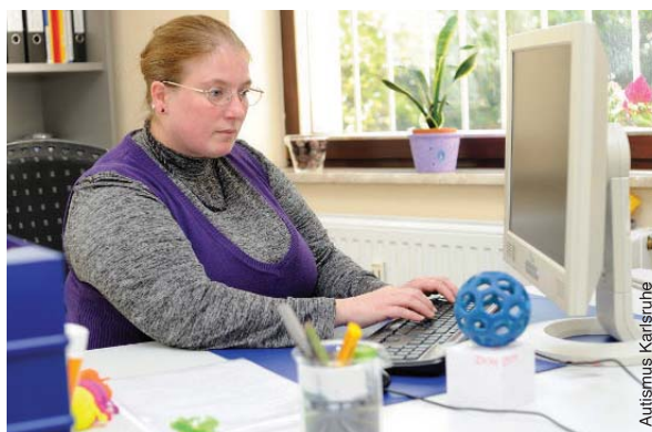
Office work in Germany.