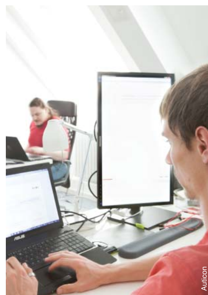
IT consultants at work in Germany.

An example of such a group has emerged at the international level, when a group of 19 representatives from organisations around the world that employ people with autism met in Belgium recently and formed a network. Their network aims to share knowledge and provide a platform for networking among business professionals involved in the employment of people with autism.