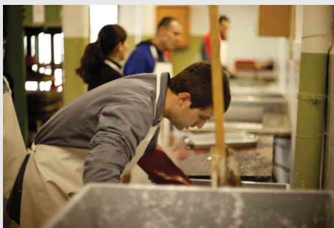
Paper recycling at TERLAB.

For adults with autism who are in need of a high level of support, it can be very difficult to find suitable employment. TERLAB is a 'sheltered workshop' near Barcelona in Spain which is creating meaningful roles for these adults through activities such as farming, gardening and recycling paper.