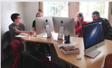
PASPARTA staff at work.

This report has been designed by employees who have autism at PASPARTA Publishing, a social enterprise founded by the autism organisation, APLA Prague, in the Czech Republic. Its objective is to offer employment opportunities to people with autism in an adapted environment where they can make use of their unique skills. PASPARTA publishes books on education, special needs education, sociology, law and other topics.