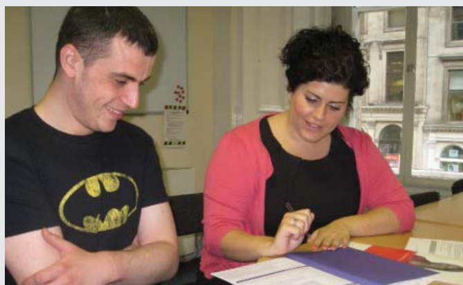
Working together at the National Autistic Society's Employment, Training and Consultancy Service.

With so many people involved in this growing area of work, the National Autistic Society has developed an efficient way to help employers, intermediaries and other autism support organisations to develop productive working relationships with people who have autism.