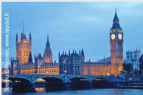
The British Parliament adopted the Autism Act, the first disability-specific law in England, in 2009.

The Autism Act 2009 is the first ever disability-specific law in England. It was created to address the lack of support for, and understanding of, people with autism among the relevant authorities in the country.