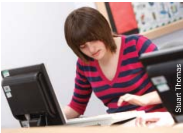
Computer-based work in the United Kingdom.

On the part of the European Union, the European Commission makes laws and monitors their implementation in areas like employment rights and coordination of social security schemes; coordinates and monitors national policies; and promotes the sharing of best practices in fields like employment, poverty, social exclusion and pensions.