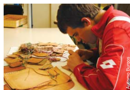
Making leather accessories in Spain.