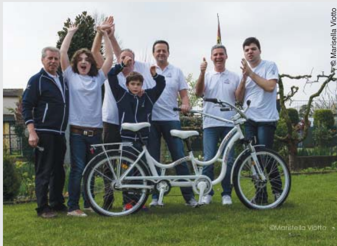
The Godega4Autism team with one of their 'hug bikes'.

Since January 2014, two adults with autism have been employed; one of whom is in need of a high level of support and the other is in need of a low level of support. The employees work with a supervisor and an ABA educator, ensuring ongoing education and skill development is part of their work.