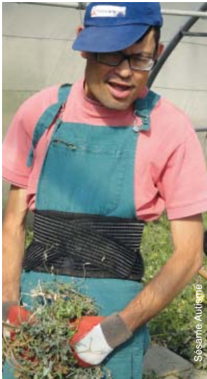
Working in a greenhouse in France.

The lifelong difficulties experienced by some people with autism, especially those in need of a high level of support, can lead them to face extreme difficulties in trying to participate in employment in the open labour market, no matter how much education, training and exposure to the work situation that they have had, and even when reasonable accommodation is provided.