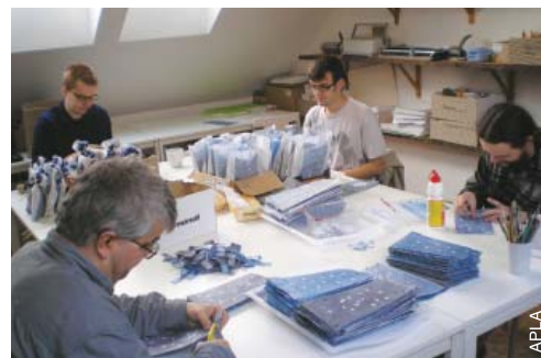
Making gifts in the Czech Republic.

“j) Ensure that reasonable accommodation is provided to persons with disabilities in the workplace;”