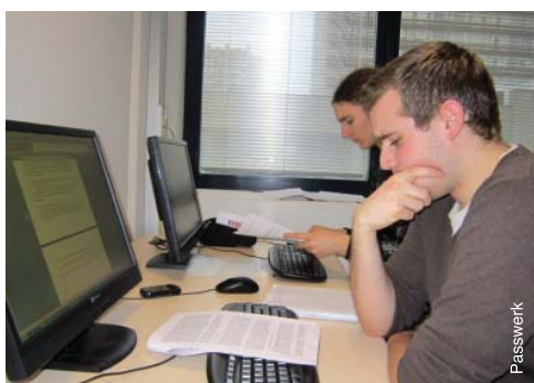
Computer software testers at work in Belgium.

Ideally, self-advocacy skills should be taught as early in life as possible. The earlier that an individual with autism starts to learn self-advocacy skills, the more practice and skills they can gain for their own empowerment throughout the rest of their life.