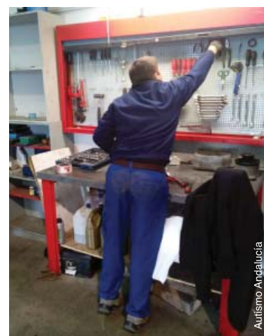
Mechanic's assistant sorting out tools in Spain.

Due to their difficulties, as well as a lack of support and widespread stigma and discrimination, people with autism experience many barriers to gaining and maintaining employment. According to the International Labour Organisation, the proportion of people with disabilities not participating in the labour market is at least twice as high as that of average EU citizens, and the unemployment rate is even higher amongst some specific disability groups, such as those who have autism. 4 There is no consistent international statistical data available for the employment rate of people with autism but various surveys indicate that only a minority are employed. A study in the United Kingdom in 2009 found that only 15 per cent of people with autism are in full-time employment and 9 per cent are in part-time employment. The same study also found that 79 per cent of people with autism who are dependent on financial support from the government say they would like to work, with the right support for their difficulties. 5