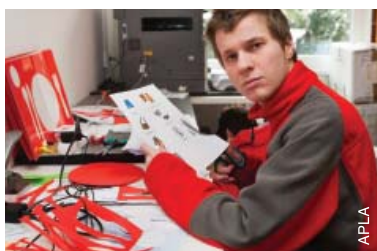
Developing skills in the Czech Republic.

The term ‘sheltered workshop’ generally refers to an organisation or environment that employs people with disabilities separately from others. 85 These workshops usually involve people with disabilities working in manual labour jobs. They can take various forms, such as day care centres where people with disabilities participate in occupational therapy programs that involve producing goods and services for non-profit purposes, or where people with disabilities participate in employment activities from which they receive an income.