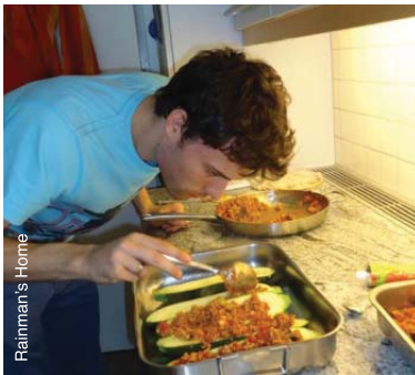
Preparing meals as a vocational training and therapy activity in Austria.

Some people who have autism are able to succeed in higher education, although they may need some extra support to settle into, or manage, university life. For example, they may require assistance with timetabling and structure, finding their way around university, developing strategies to manage anxiety and support in lectures and laboratory sessions.