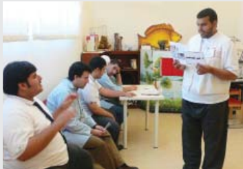
One of the teaching assistants working with students.

It is not only from Europe that we can find good practices emerging in the employment of people with autism. The Kuwait Center for Autism currently employs four adults with autism within its own services.