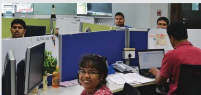
Staff with autism at SAP in India receive individual support.

Danish organisation, Specialisterne, takes multiple approaches to inclusion and support for people with autism in workplaces around the globe.