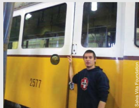
Salva Vita Foundation helped a young man whose interests were cleaning and trains to find a job in Budapest cleaning city trams.