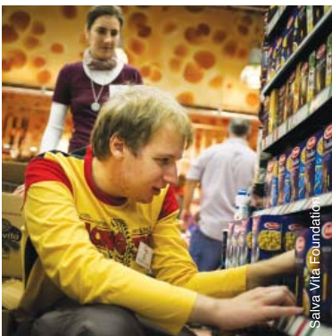
Restocking supermarket shelves in Hungary.

The European Union ratified the Convention in 2010. As the European Union and national governments share responsibility for policy in the fields of employment, social affairs and inclusion, the responsibility for implementing these aspects of the Convention is also shared. 25