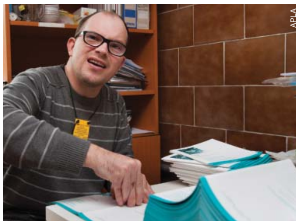
Administrative work in the Czech Republic.

Self-determined structures for employment of people with autism can be most effective when they involve people with autism who have a relatively high level of intelligence, a good understanding of their own challenges and needs, and relatively strong organisational skills.