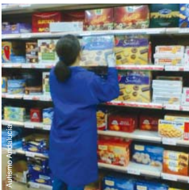
Restocking and tidying the shelves in a supermarket in Spain.

Each person with autism is different, however they have impairments in three main areas: reciprocal social interaction, communication, and restricted, stereotyped, repetitive behaviour. 1 They can also experience hyper- or hypo- sensitivities to tactile, auditory, and visual stimuli, and have unusual responses to heat and cold and/or pain.