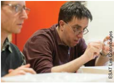
Working in small teams to avoid stress in France.