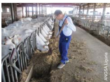
Taking care of the cattle on a farm in Italy.