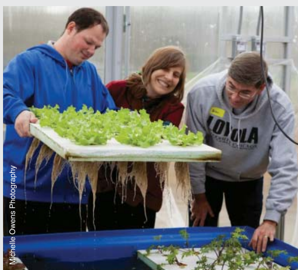
The 'aquaponics' method of farming in which fish and vegetables grow together.

More information: www.greenbridgegrowers.org