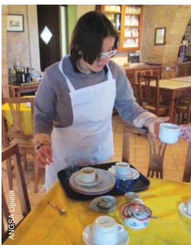
Working in a canteen in Italy.

Due to their impairments, people with autism often experience the following difficulties that hinder their ability to participate effectively in work: 2