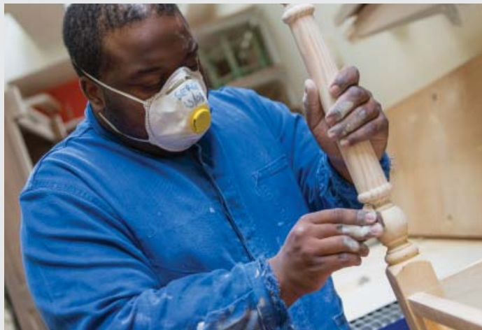
Furniture restoration at ESAT Les Colombages.

The organisation runs five workshops in which employees with autism produce goods and services. These are sold in the open market or through the organisation's retail store, which also employs people with autism.