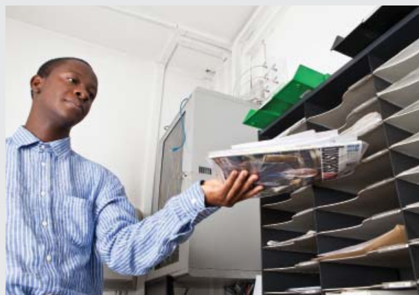
Sorting the daily mail in Glasgow, Scotland, as part of the Prospects initiative.

A two-year pilot study 83 of the 'Prospects' initiative compared the employment outcomes for two groups of people with autism: one group who received specialised support designed to meet the specific needs of adults with autism from the Prospects initiative and another group who received support from a generic disability support scheme.