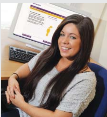
The National Autistic Society's 'Ask Autism' online training is delivered by people on the spectrum.

'Ask Autism' is a new training service of the National Autistic Society, offering a range of products for professional development. Developed and delivered by people on the autism spectrum, Ask Autism provides an 'insider' perspective of autism to give professionals and relevant stakeholders a unique understanding of how people with autism would like to be understood and supported.