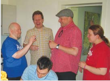
Volunteers working at Puoltaja online magazine.

'Puoltaja' is an online magazine produced in Finland by volunteers on the autistic spectrum; most of them with Asperger's Syndrome.