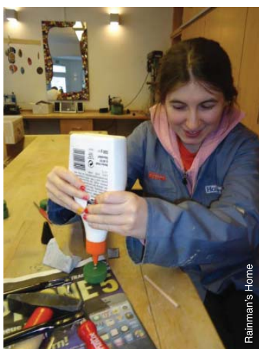
Developing woodwork skills in Austria.

Criticisms of sheltered workshops have mainly centred around the segregation and exploitation of people with disabilities and the denial of their rights that has taken place in some of these workshops. For example, workshops in which people with disabilities work in jobs that are below their level of skill, for pay that is below minimum wage, for organisations that profit substantially from exploiting their labour and offer them little or no opportunity to develop their skills for the open labour market. 86 The people with autism who work in these sheltered workshops have often been those who have been institutionalised and their participation in sheltered workshops has not been a result of the free choice of the individual or their family members. 87 Clearly, these practices cannot, under any circumstances, be considered acceptable.