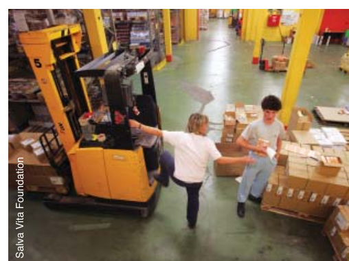
Working in a warehouse in Hungary.