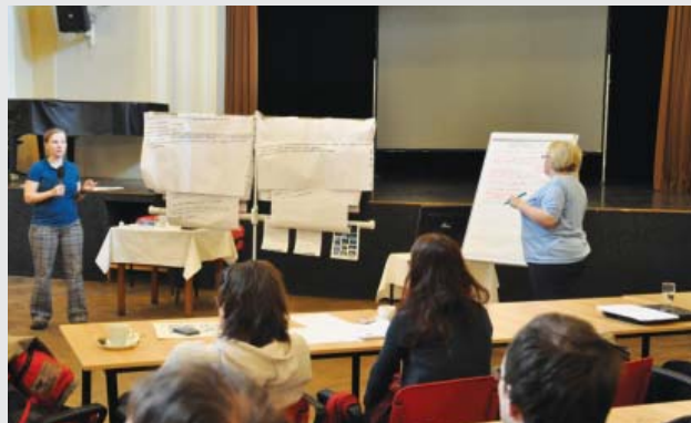
A meeting bringing together stakeholders as part of the Together We Can Manage project.