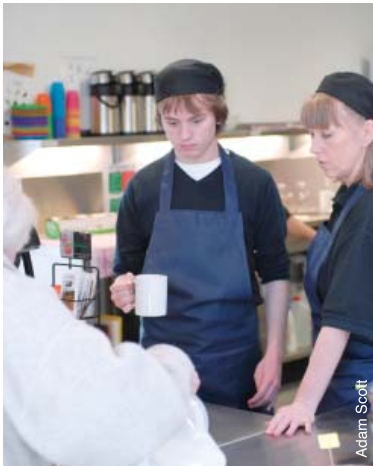
Working in hospitality in the United Kingdom.

communication can also assist them to communicate more effectively. In addition, modifiable scripts may be used to teach and assist a person with autism how to communicate effectively in various situations. 53 Advice regarding the use of clear and direct language (as outlined in the section on conducting job interviews) of course also applies when the person has been hired.