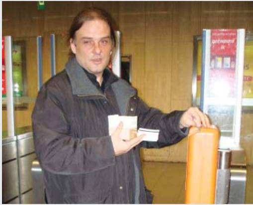
Passwerk employees on location, testing access gates in metro stations

A Belgian company, called Passwerk, employs 40 people with autism in software testing and quality assurance projects, both in the office and on location-based projects.