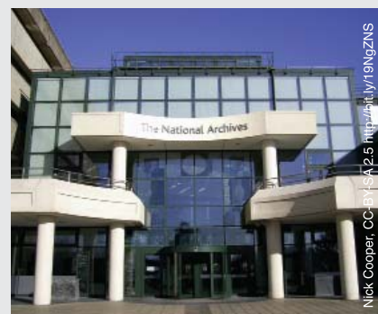
The National Archives building in London, United Kingdom.

The National Archives also offer work placements to give people with autism the opportunity to gain valuable work experience and develop a range of interpersonal and life skills.