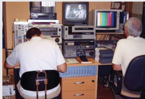
Technical assistants archiving videotapes in a local organisation.

The programme provides people with autism with individual support, such as specially trained job coaches, to help them develop the skills required for their jobs, and to provide support in communication with their managers and colleagues. The support is gradually withdrawn when the presence of the job coach is no longer necessary and can be replaced by natural supports, such as colleagues who can understand and support the needs of the individuals with autism within the workplace.