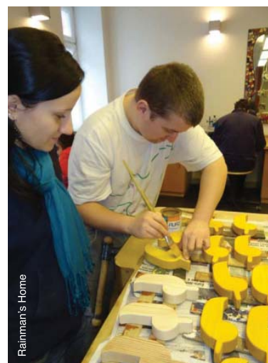
Developing woodwork skills with personalised assistance in Austria.