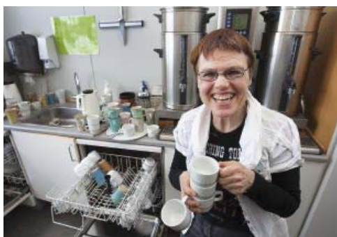
Making coffee and assisting teachers at a school in Denmark.