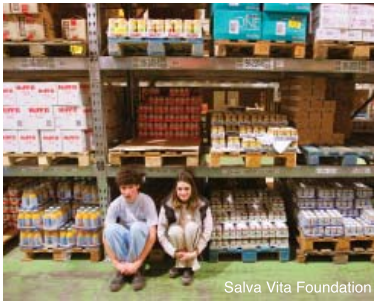
In training to prepare for work in a warehouse in Hungary.