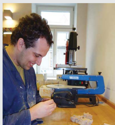
Woodwork at Rainman's Home.

The second stage (the 'focus' group) engages participants in cognitive training, computer work, cleaning the work area, silk-screen printing, working with wood and clay, outdoor and social activities, sports and music.