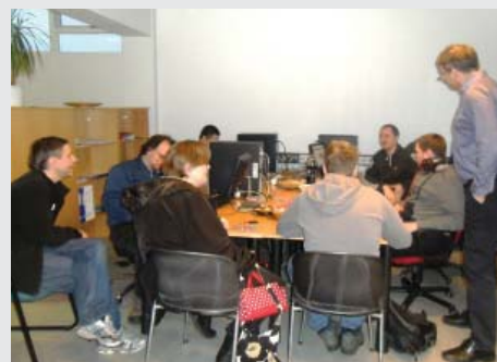
Specialisterne in Iceland offers vocational training to people with autism in order to help them find employment

Specialisterne's assistance has helped many individuals with autism turn their lives around, not only developing skills for employment, but also for social interaction.