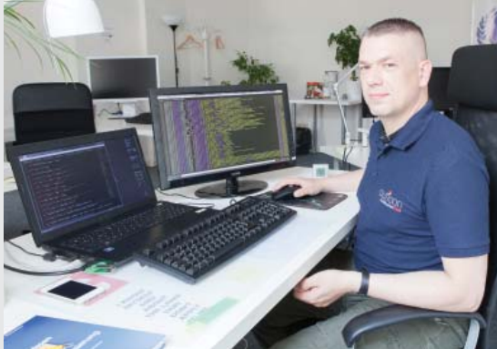
An Auticon consultant at work.

A German IT company is helping adults with autism to support themselves and live more independent lives through employment.